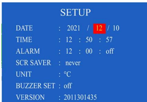
Figure 4Setup menu

Note: The unit can also be operated permanently with a mains adaptor.