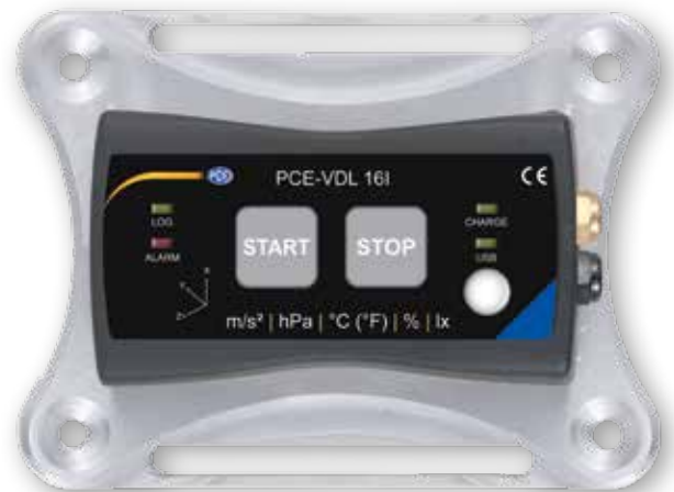
Data logger with optional mounting plate PCE-VDL MNT