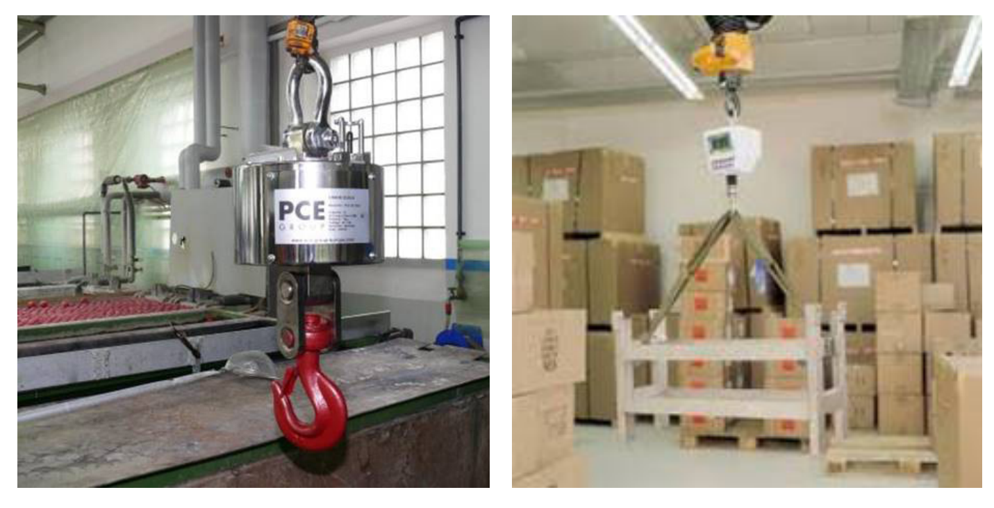
In agricultural applications