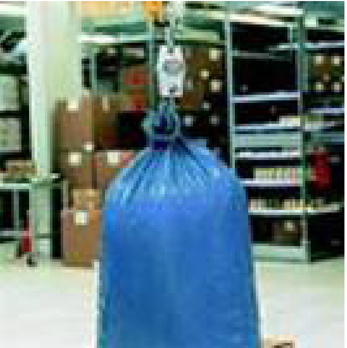
In waste weighing