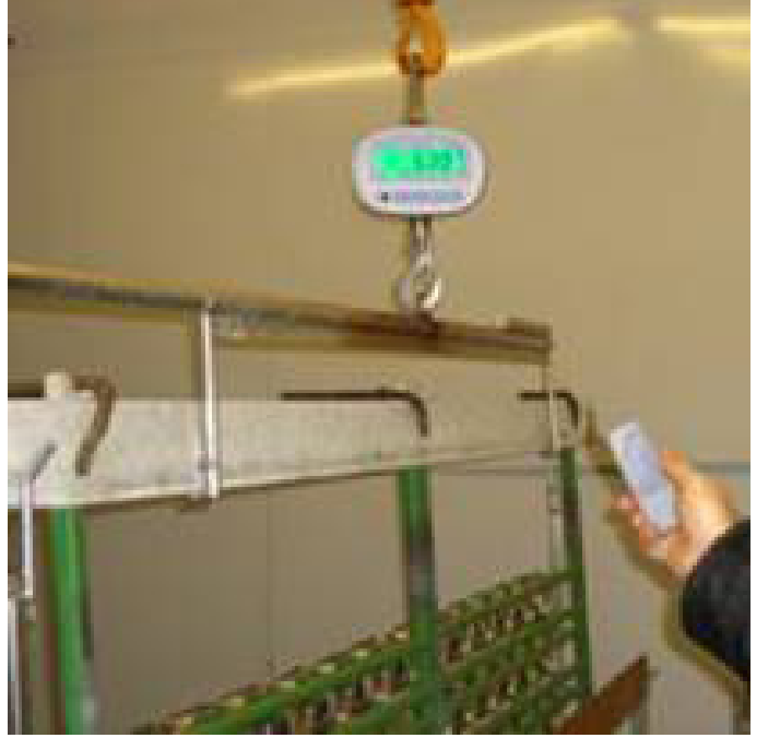
At a feeding station