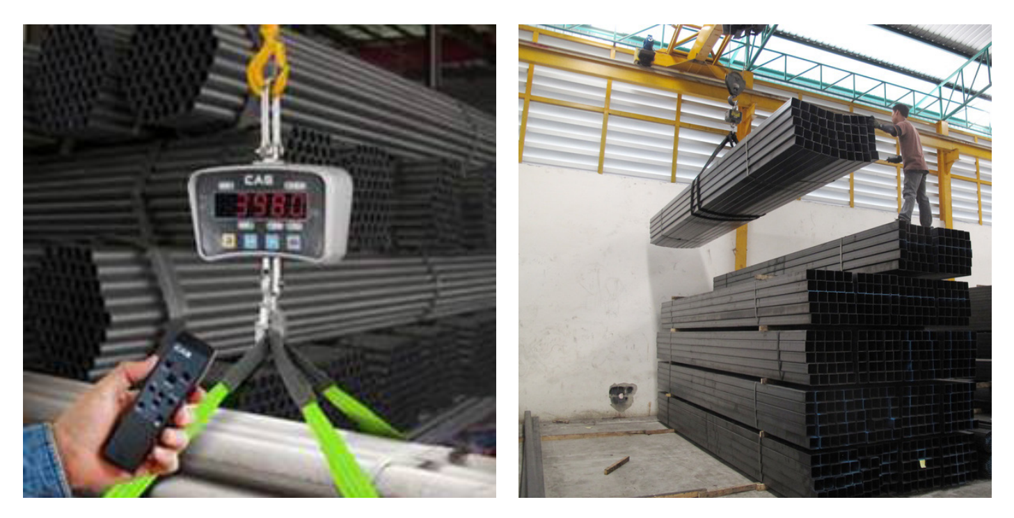
Industrial weighing of steel pipes