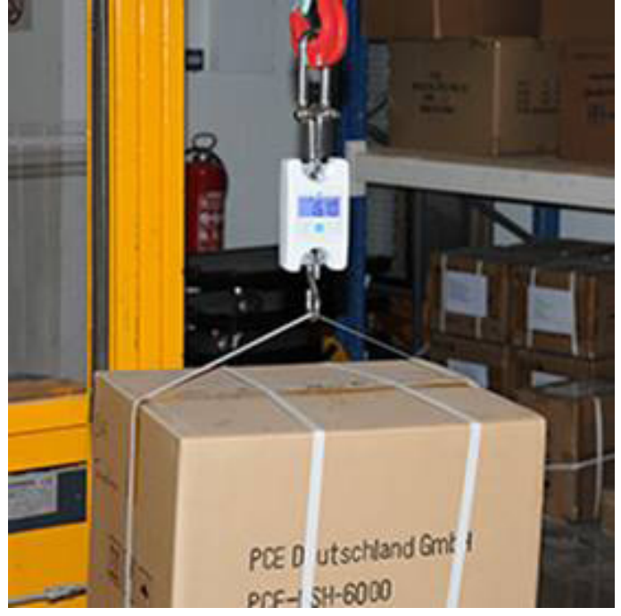
For smaller loads in parcel weighing