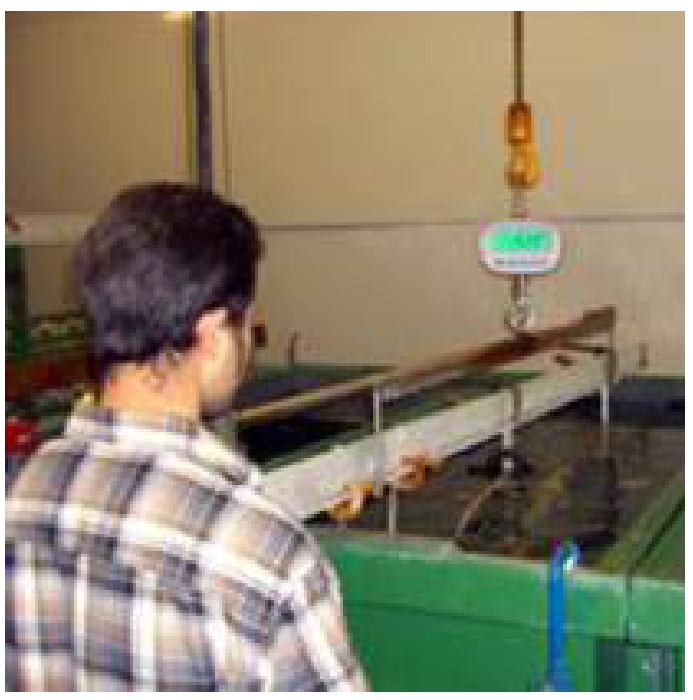
In industrial use in a galvanic company