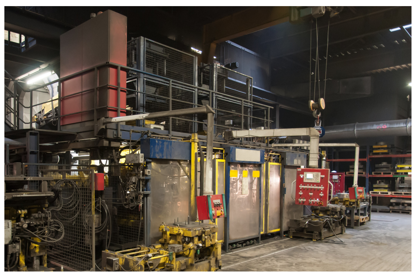
For use in metal industry