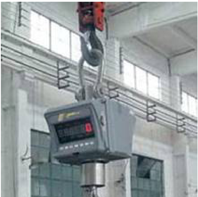
Crane scales for metal wire reel weighing