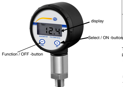
Fig. 2 LC-Display