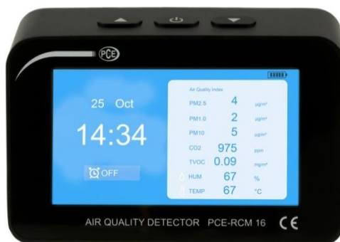
Figure 2 List view