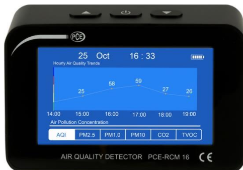
Figure 3 Graphic view