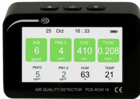
Figure 1 Standard view