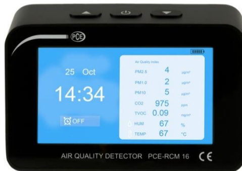
Figure 2 List view