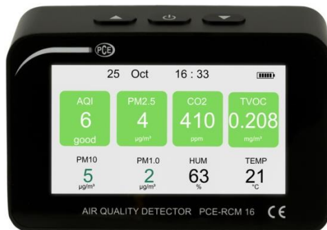
Figure 1Standard view