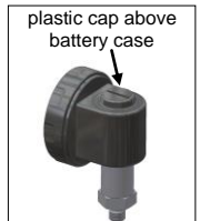
Fig. 1 battery case

! An incorrect usage may cause a leak out of batteries and so a damage the device!