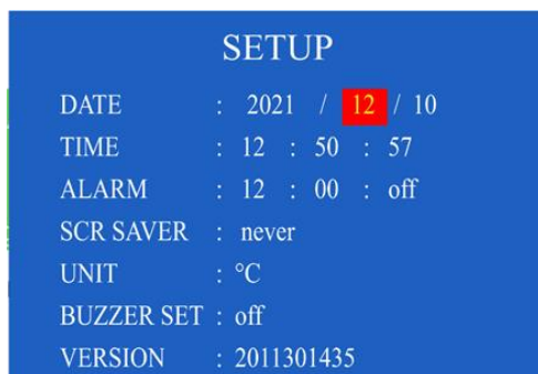
Figure 4 Setup menu

Note: The unit can also be operated permanently with a mains adaptor.